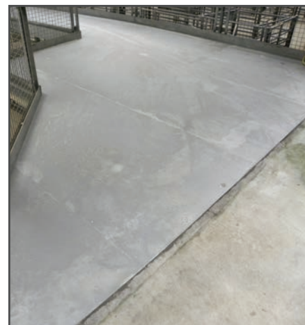
4mm gridded plate in grey

across the whole agricultural sector including dairy farms and abattoirs. The non-slip benefits of GRP goes hand-in-hand with the needs of these businesses to provide a safe working environment for their workers while reducing regular maintenance costs'.