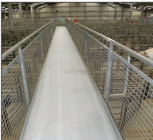
Cattle gallery with 4mm GRP gritted plate in grey

Aware that the product is suitable for multiple sectors including agriculture, marine, food and beverage and distilleries, John Bell Pipeline proposed an alternative solution to the ANM group for upgrading the viewing gallery over the cattle stalls and stair well at the Thainstone Mart, Inverurie.