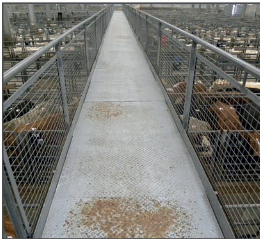
Cattle gallery before