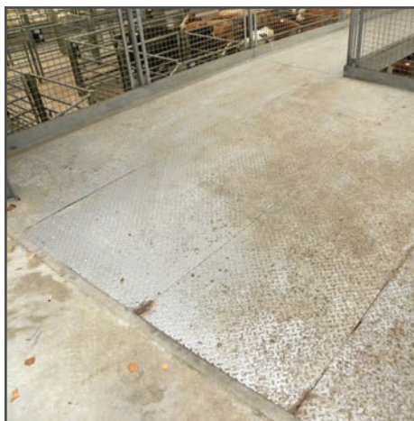
Before gridded plate